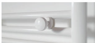
A242 white handy grip for Vetta