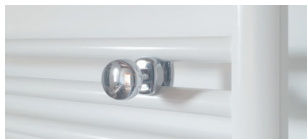
A243 chrome handy grip for Vetta