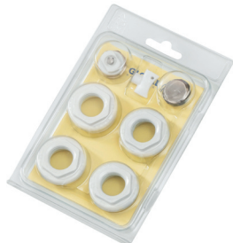
REDUCER KIT WITH SILICONE GASKETS AND ADJUSTABLE VALVE