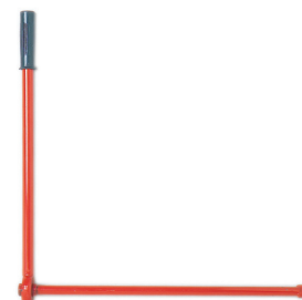
A079 hex key with lever A080 hex key 500 mm A081 hex key 800 mm