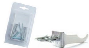
A029 square brackets white blister pack (pair)