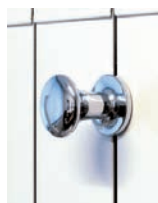
A237 white handy grip A238 chrome handy grip