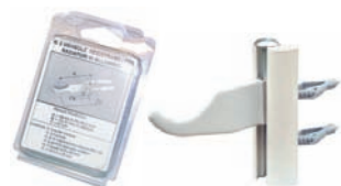
A027 universal brackets white blister pack (pair)