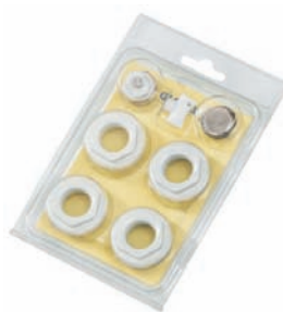
REDUCER KIT WITH SILICONE GASKETS AND ADJUSTABLE VALVE