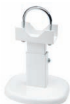
A015 white floor fixing system